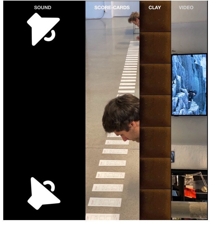
Fig. 3—a distribution of discrete layers, mapped from the Dunkedunk learning theatre, in which the adjacency between the layers makes them readily available to be connected operationally by the visitors. Which means that the visitors are primed to connect the much greater variety of elements in circulation during an event, moving from a distributed inventory of items, to a distributive intelligence . A case in point of intercepting information allowing an overall assessment.

Here, the logic of the kernel and the image is extended beyond the format of the logbook, to the detail of how an entire space is layered for a scope of an event in the learning theatre: for instance, the learning theatre devoted to Nataliia Korotkova and Nina Tsybolskaia's exposition in VIS (Nordic Journal of Artistic Research) [RE] MAPPING OF BEING - LANDSCAPE/CAVESCAPE/HUMAN-