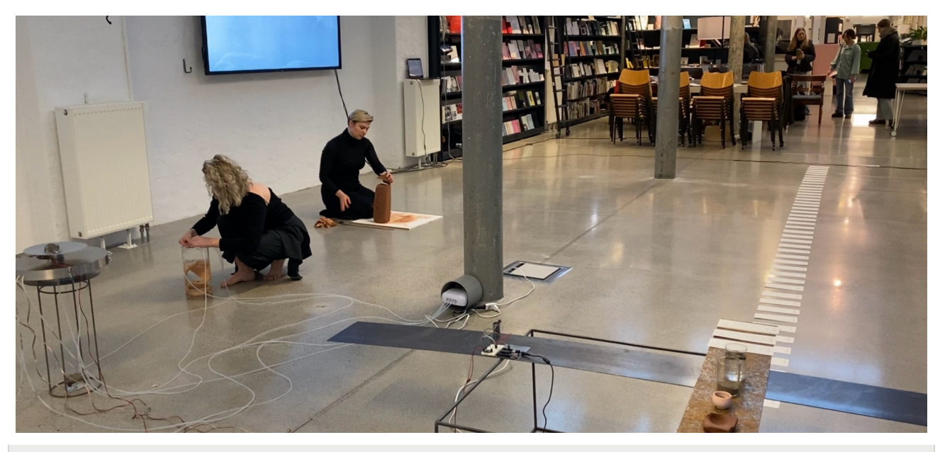
Fig. 1—Staging for Dunkedunk research project for the ARW24 event in the KHiO library. In the background a screen, next to it an area where clay was cut and circulated when the visitors came; then a row of score-cards for the audience to fill their backs turned to the screen. Out of the photo the sound source to the right.

A theoretician can be seen as a player. But one can be more than one player. We expect of our MA students that they should act as more than one player. Based on the knowledge that the designer articulates a varied repertoire that reflects the variation in their playgrounds as professionals. Focussing specifically on theory therefore does not exclude this variety, but rather articulates an aspect of managing it. For instance, theorising regularly hatches information that helps us assess a situation from a different angle; given a staging, directing and rehearsal that does the trick.