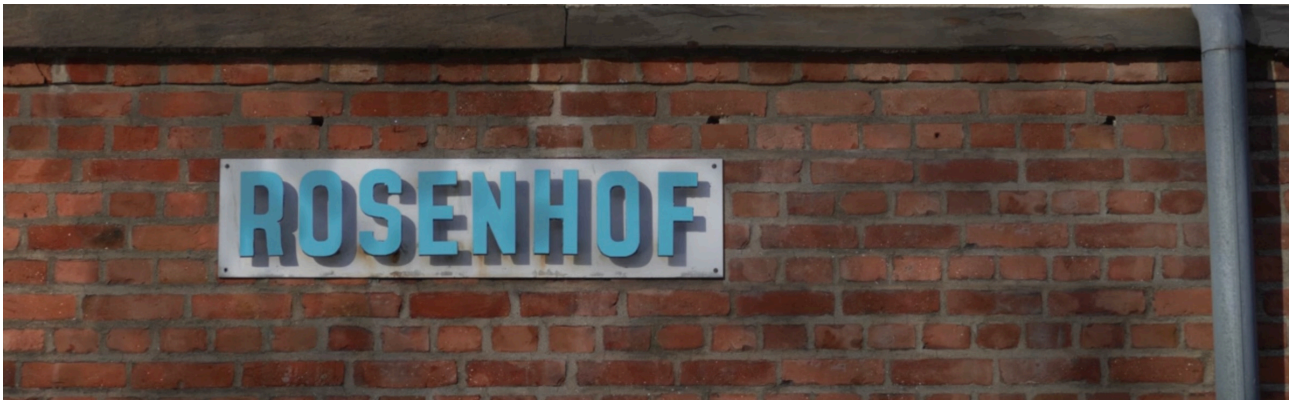
Fig. 1—Rosenhof in cast metal letters (sans serif modern grotesk font): naming is an initial act to lodge an entity—here a school-building—which could/not be there. As a trace from a teeming life of yore, it could be removed. When removed it would continue to exist in language, but typically prone to slips of memory. Between subject and object: affect