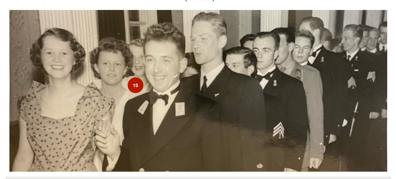
Fig. 1—the photo at the top right is from a Polonaise at an cadet-ball in Tønsberg, at the Club in 1953. The two characters joined by the red dot will marry each other in the coming year. At this point she is 21 and he is 22 years. They married about 1 year later December 28th 1954. His military career at the Naval Academy, would extend till 1961, when he was selected by the Foreign Ministry to serve as a career diplomat in the Norwegian missions abroad. He did not leave his native Sandefjord for her, he left with her for a life abroad.

A young man wrote in his letters to a young lady explaining that he was of an impulsive character, but would be a good boy for her sake. He explained his early resolution—a Navy cadet—to beguile a woman in each port, by this impulsiveness . He explained his temperamental moods in this way, but also that he surrounded himself with a hardened shell. He also explained his "impulsivity" with deficiencies in his upbringing: his father had an alcohol-problem, was absent due to his work as a whaler, caused trouble when at home; he had been in a <u>correctional institution</u> while in his youth.