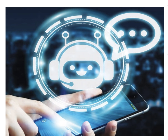
If we count the cultural turn in the conjoint turn to society and nature in modern and contemporary history, the human life form is about to articulate in this interstitial space, articulating from the meantime. The question explored in the body-text is whether and how a truth process and analysis that proposes a design or Al usership, can be integrated into a transactional imputation of value. That moving up from the backdrop to the exchange.

Or, even further, that the stochastic processes in the virtual and the actual can be mutually constraining. So that what we are talking about is not divergent multiplication, but the multiple in the scope of convergence : in other words, it is (at least potentially) a disordered system . That is, featuring hetero-structural outcomes that are emergent, but with system- like properties: they are