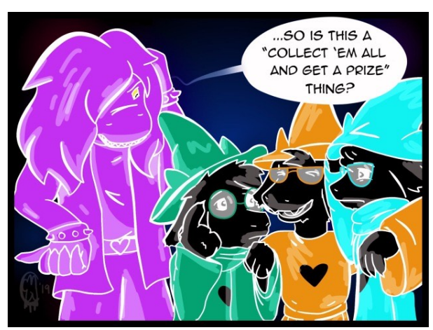
A meme: a meaning unto itself that denies its own reality; a meaningless contraption that contains its own reality to others.

Which that what we are talking about—in Badiou's terms—is the evental site. Agency, in this