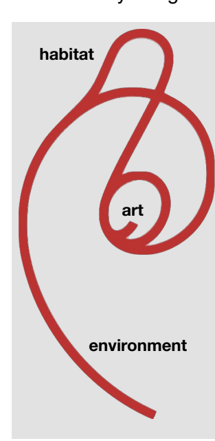
Fig. 2—are there common notions (that conceive and embody) to link terrestrial environments with human habitats: that is, between the proliferation of extreme conditions and human life-ways?

We realise that it still exists in the perimeter of digital equipment, bordering unto a very physical world. We propose this as a site-location for what—in the current lingo of artistic research—is called an <a href="exposition">exposition</a>. It is what we might call a <a href="candidate">candidate</a> public space. It might/not be public. Yes, it has been published in <a href="VIS">VIS</a>. But in the oecumene of artistic research is marginal since it is produced by two MAs in design, who are not PhD fellows (yet, funded by the <a href="mailto:Barents secretariat">Barents secretariat</a>), and have been prepared, through the MA programme in design, to do <a href="mailto:artistic research">artistic research</a>. In our conjoint investigation we will attempt provisionally to turn these working conditions into an asset.