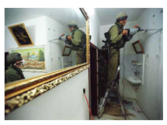
Frieze Magazine, illustration from Eyal Weizman (Forensic Architecture) on IDF urban war strategy, The Art of War. May 6th 2006. Creating paths in urban warfare by moving through walls. From striated to smooth space (Deleuze and Guattari). Moving through walls in the horizontal plane .

People who are perceived to lack—and thereby be denied—identification on account of their condition (which is part of their condition as a dominated group). They readily become similar to to other dominated groups (which is also part of their dominated condition). And they will be understood, not by reference to their acts and history, but on account of their culture. A culture which is typically without history. A relative culture. The culture of isolates that can be compare. Results and overview which is basically social anthropology at its worst in post/colonial history.