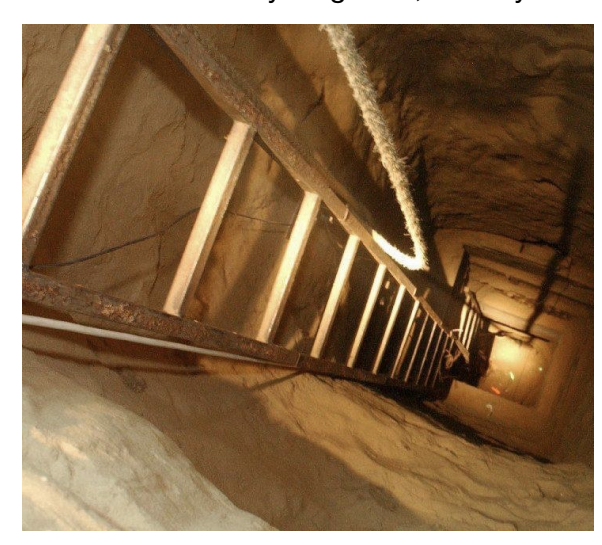
Modern war institute; What can the IDF do about Hamas war tunnels? If the Israel Defense Forces conduct a ground campaign in Gaza, the threat of Hamas tunnels will be one of the most significant challenges to contend with. Many miles of these tunnels crisscross below the surface of Gaza, some as deep as 230 feet underground. Collectively, they offer Hamas fighters the means to protect themselves against the Israeli offensive, maneuver undetected below the surface, and launch attacks before returning to the security of the tunnels. Moving beyond reach in the vertical plane.

The critical threshold is when as the irreducible human experiences find an orientation in space because—at the human existential level—it appears that there is no other option. It will never be managed but can always be hosted. And it is in the acceptance that who else is there will be a different place as this fruits of human labours will be received, that the experiences and work (the labours) that defined us, will become spatiotemporally oriented. Without this, in the meantime, there cannot be any long term, nor any sustainability (no partnering of people and planet).