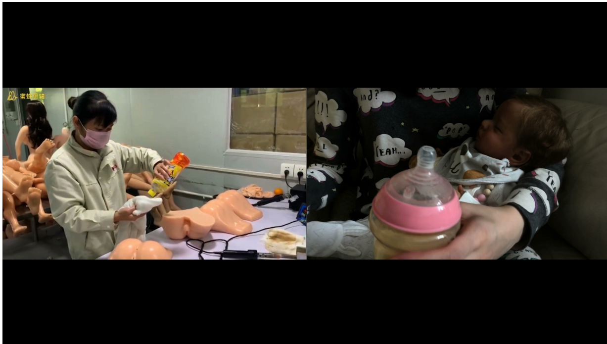
Video stills, The Second Shift (2023)