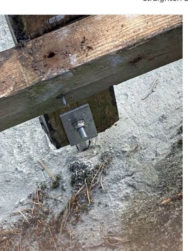
Figure 4. Post shoe

And, above all, the staircase now appeared to be stable and safe. To complete her mission, she wrote some words in the guest-book an adequate thing to do for a person in her position - where the project was described in more/less the same terms as the ones given here. In her partner's entry the project was then integrated into the account of other current jobs. The stair was subsequently varnished with a dark brown wood-stain that gave it a new appearance compared to the rest of the house, where the same stain was used. And contributed with a finished element on a façade where new planks were still unvarnished.