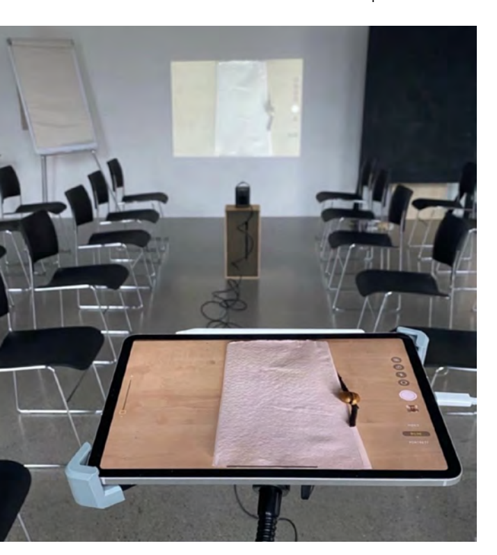
Figure 3. Learning Theatre at KHiO

The sensorial cogency of our daily remembrance changed in its design-core. That is, what we do to transform a current situation into a preferred one: here, from trouble to problem. From the trouble of the pandemic to the problem of the lockdown. How we transformed an unsegmented terrain, into a map of problems that came our way4. Which is how we choose to present the portfolio which this presentation is dedicated to: a cartographic project in Latour's sense (2018).