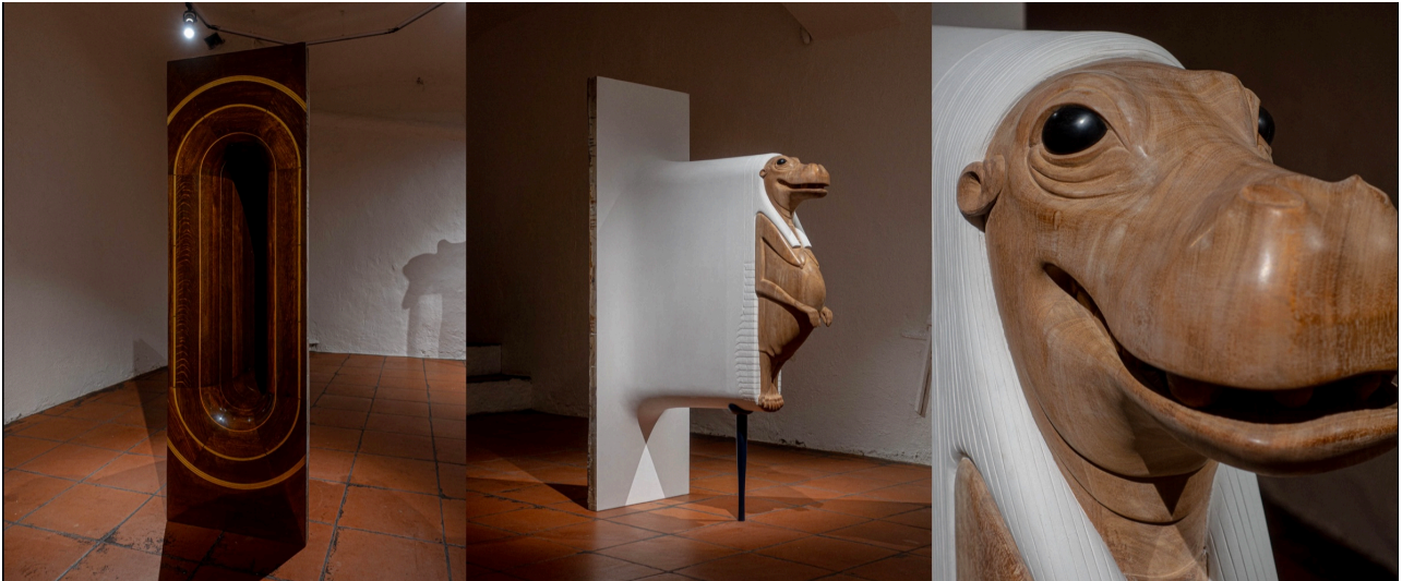
Rear profile and front of Taweret (Bjørn Blikstad). Photo: Jørn Aagaard (for HULIAS. Taweret is the terrible mother—daughter of the Nile—that will do anything to protect her children. Taweret is a crocodile, lion and hippo compounded. Her teeth and claws are sharp. On her back a gaping void. In Bjørn Blikstad's lingo; a black hole. The walls of the hole approach a thinness that also verge to nothing. On the front side the carving is maximally full.

Arguably, vectors are ornamental in that they indicate a tendency, a direction, a proclivity and are empowered to indicate a dynamic state of an object that, by virtue of our vectorial understanding of it, is the mode of appearance of a body : this expanded phenomenology of embodiment, expresses a notion of the body found in Merleau-Ponty's philosophy. The internal relationship between the vector's coordinates can be functional/not. But it is the vectorial sum—expressed in A + Bi = X —featuring the ornamental function. Entering the object into the œcumene of bodies.