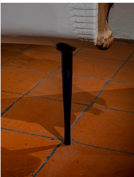
Support, crutch, stilt or peck underneath Taweret, preventing the structure from tilting. The appearance of the ibis-bird is likely wanton. Or, alternatively, it relates to the logic of things. That is, when things start operating according to their own logic.

Which means that our labours of accepting the world—or, barely dealing with it—is what prompts human beings for instance to do math. That is, something comes before the playful creativity that we readily assign to ornaments and to stories. In a narrow sense, ornaments is a way of making our peace with the world. And that it is in a hope and chase of completeness that we engage in ornamental pursuits. In Hebrew peace writes (לוםֶשׁל) shalom , while completeness writes shalem (לוםֶשׁל wholeness, or perfect peace). Support is קַב (kav).