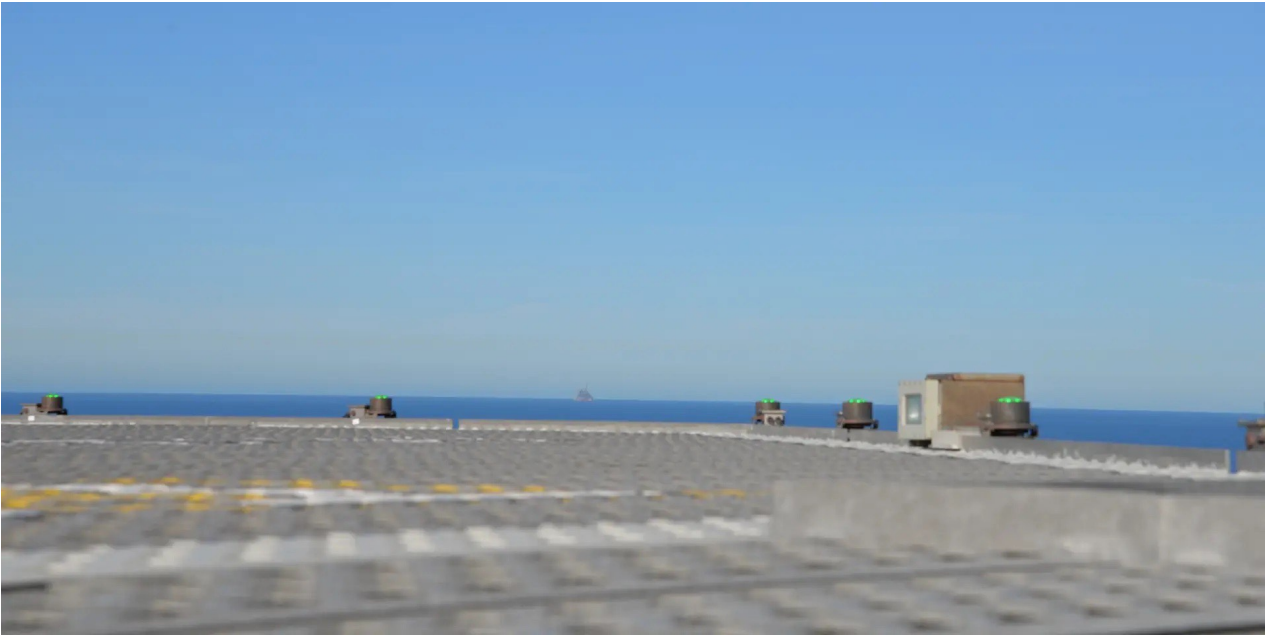
Helicopter deck at Troll A.

If a syndrome is a mesh of interlocked causes and effects, and trauma —in the psychoanalytic tradition—is a state of narcissistic infatuation with a syndrome; then, at the other end the syndrome (seen as a potential), there are cultural paradigms bordering to linguistic repertoires. Then a paradigm can be defined as a comparatively stable fiction, moving beyond neurosis onto a medial zone where it can be submitted and discovered: in a longer than life-time span as of an archive .