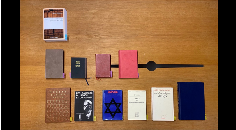
Books with signatures: facsimile from 1888, novel 1986, prayer book 1994, anthology 1968, novel 1988, list of heraldry 1959, ethnography 1977, politics essay 1965, philosophy 2019, comparative epistemology 1988, history 1989.

Tuesday November 2nd we gathered during a lunch-hour to test whether a lineup could bring some attention and attitude to something as inconspicuous and technical as print-signatures. In the above lineup colour codes (cyan, purple and yellow) are used to indicate the signature-number.