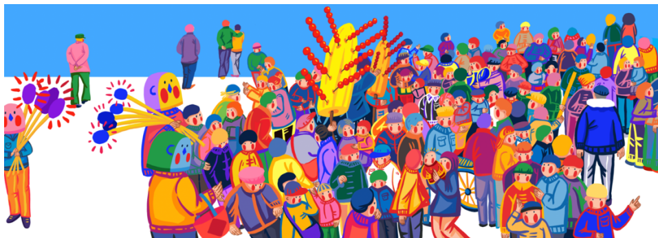
- part of outcome