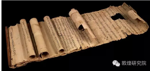
- traditional Chinese scroll

The first one, based on the traditional Chinese scroll, the most common form of scroll Chinese painting. I chose this as the main display method because It is like the oldest movie. You can look to the right and left by yourself and then will expand the whole story.