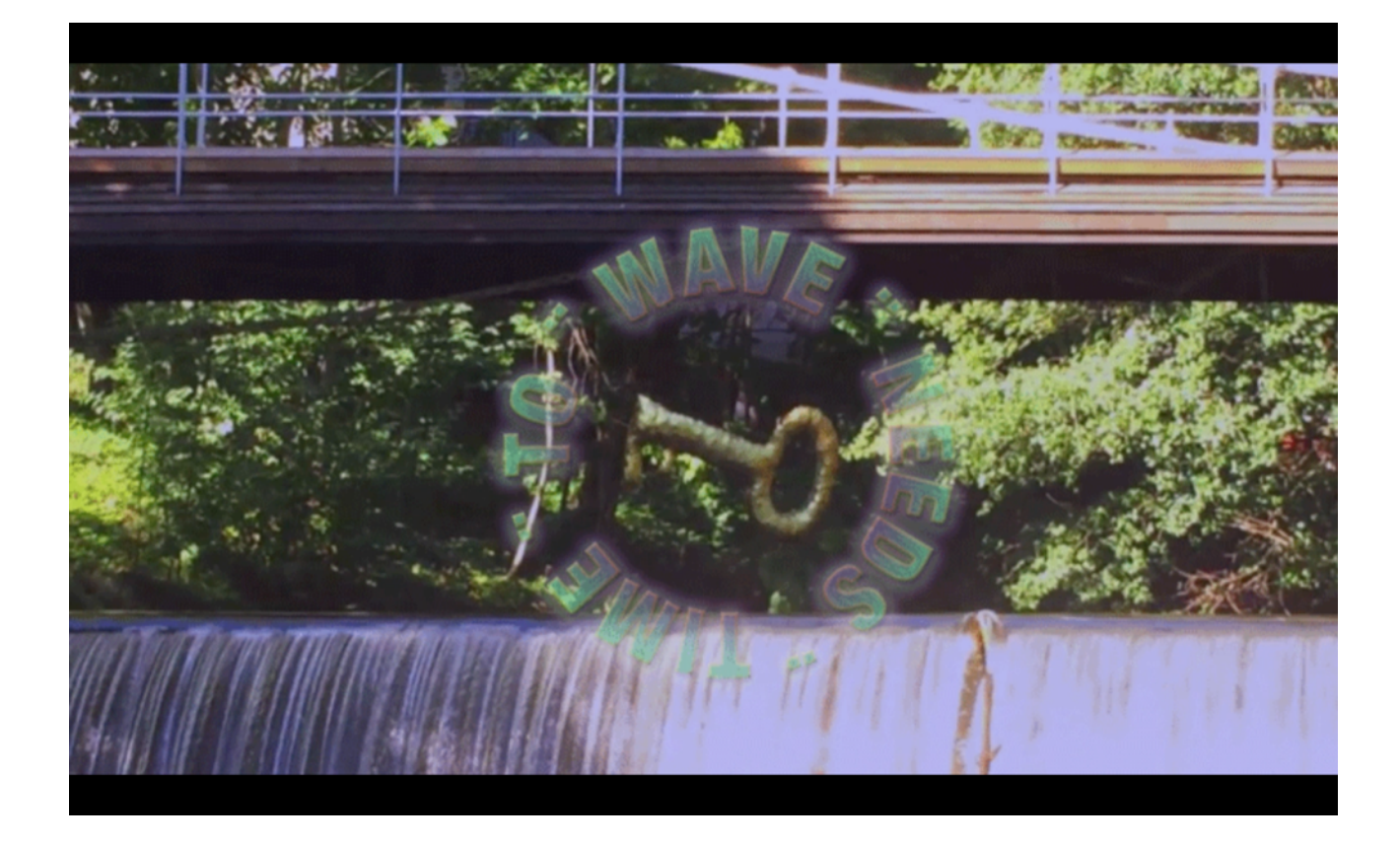
Wave needs time to wave, 2016, Akademirommet, Oslo, NO.

Wave needs time to wave, 2016 (<u>https://vimeo.com/188926107</u>) is a title of the one of the performances which was organised in the Akademirommet in Kunstnernes Hus in Oslo. I manage to invite around twenty people to act and perform - the rest was fulfilled by the public which as well was an active part of happening, contributing for example in the chorus singing, directed by one of the performers. I set up a huge plastic pyramid tent in which the event had a place. We have experienced the materialisation of the magician who was engaged in his chaotic rituals. We could meet there a holy spirit - the great mother as well, calm and grounded person meditating between another people. We spent there around seven hours, step by step watching actors performing, playing music and later on just talking - the quality of muting wheels of the wave.