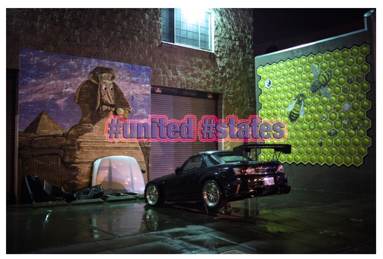
#united #states, 2016, The Lab, San Francico, US