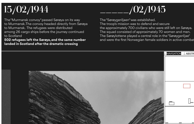
Fig. 2—From the exposition [RE] MAPPING OF BEING - LANDSCAPE/CAVESCAPE/HUMANSCAPE the historical events by their coordinates in time and space. Below: their coordinates in the exposition (research catalogue). This way of referencing expositions reminds the use of title-locks in architectural plans/drawings.

Of course, they might not agree with this description—as they have projects and they have published in VIS (Nordic Journal for Artistic Research)—since it is on their own merits, without initiative, encouragement nor support from the school. The reason why I am still making the connection is that I am calling for a historical responsivity at the school to follow the contributions that our alumni are making to subjects that teach, questions that we speculate about, research that we do. History is no longer something that we can assume, but must actively assign by working on it.