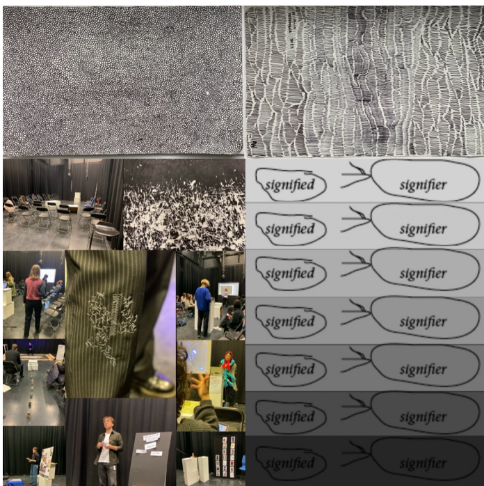
Fig. 2—A compression of the pictorial data from the live-session (sampled from the two preceding compressed handouts 3 & 4). The model moving from the signified to the signifier is sampled from Em Mikalsen’s piece, based on the work discussed at the end of this compressed handout.

If we today may sense the necessity to return and query ‘dialectical materialism’ it is partly on this basis: as much as the North American corporate sector would like to take credit for being at the forefront of the development of AI, it is quite clear that a number of the contributors to the development of AI are from the USSR (or, more broadly, formerly communist East- and Central Europe). And the assertion on people from the natural science & technology sectors in this region were the most articulate on matters concerning social development, history and politics.