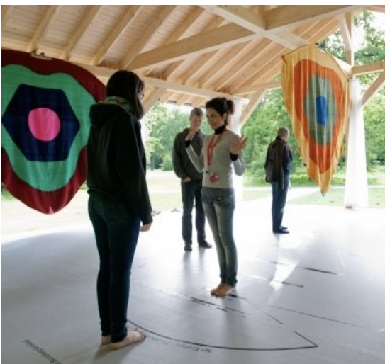
Fig. 2 — Threing : a performance-based interior architecture developed by Paul Ryan (tapestries by Luis Berrios-Negron) for a pavilion in the Karlsauae at dOCUMENTA13 in 2012. Relations can be hatched as space-givers .

It is a point at which the practitioner is challenged to move from a mode in which they are steering after the object-causing-desire a —pursuing it as they present—into a different mode where they are asked to take one step back : to consider their own delivery from the vantage point of the other . They also are asked to deconstruct something that was conjoint during the presentation: by separating the item which previous held the desire to exhibit it. This is not something self-evident, but still a regular demand in an art-school, or art-community. Knowing when to stop-and-shift.