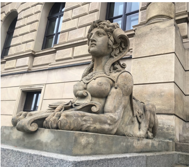
Fig. 2—Sphinx at the entrance of the Růfolium Concert Hall in Prague (1885)

Instead, one may consider that hysteria results from the swap, and as such has something in common with the project of psychoanalysis itself: it is not directly concerned with the truth → agent → other → production sequence, but swaps it for the con-sequence $ → S1 → S2 → a , where the substitution will entail the simulation and erasure of the first sequence. If such be the case, the logic of transference and counter-transference would be imminent. Simply because the first sequence will not be erased completely. It may be simulated up to a point, treated as though identical and then retrieved at some cathartic turn.