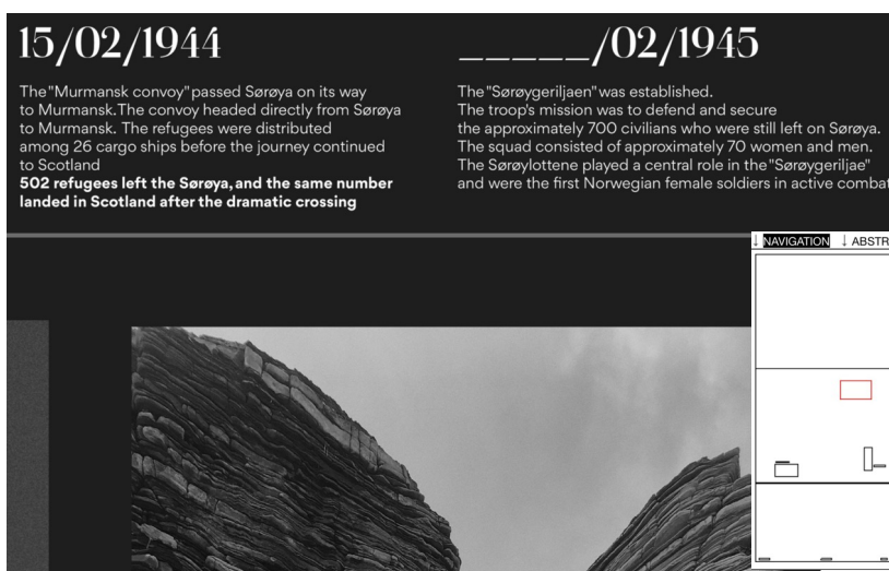
Fig. 2—From the exposition [RE] MAPPING OF BEING - LANDSCAPE/CAVESCAPE/HUMANSCAPE The historical events by their coordinates in time and space. Below: their coordinates in the exposition (research catalogue). This way of referencing expositions reminds the use of title-locks in architectural plans/drawings.

Of course, they might not agree with this description—as they have projects and they have published in VIS (Nordic Journal for Artistic Research)—since it is on their own merits, without initiative, encouragement nor support from the school. The reason why I am still making the connection is that I am calling for a historical responsivity at the school to follow the contributions that our alumni are making to subjects that teach, questions that we speculate about, research that we do. History is no longer something that we can assume, but must actively assign by working on it.