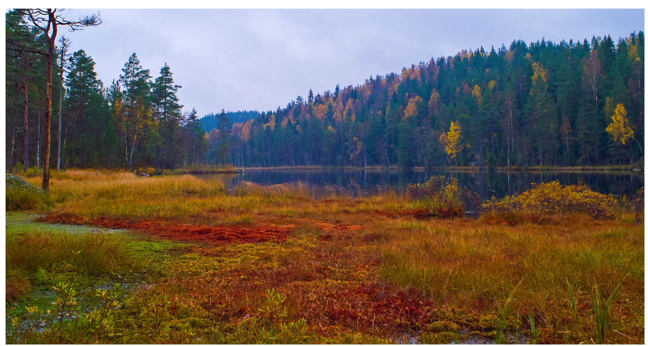
There are two cultural turns: one expanding art to social critique (1960s), the other making nature a part of our cultural heritage (2000s). Two tiers?

When we speak about the 'cultural turn' it is [at least] in two senses. The first is the cultural turn in in the 1960s in modern art and university marxism —away from aesthetics and labour theory—and the cultural turn in the way we think of nature: nature as cultural heritage. As an example of the latter: within the Federation for Environmental Protection of Oslo/Akershus (NOA) some areas with backwoods around Oslo were kept secret for protection; after the enforcement of the <u>Marka-law September 1st 2009 §11</u>, these areas became publicised as cultural heritage (for their protection).