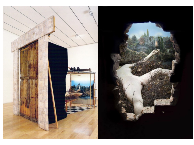
In Étant donnés Duchamp is playing with the machinery of perspective (Le gaz d'éclairage) and the after image (La chute d'eau). The first relating to meaning, the latter to a causal chain (closing the door, which acts as a camera shutter).

The latter is from Arnd Schneider's reframing of <u>vision</u>—featuring the still as a moving image—in the ethnographic account of fieldwork. In sum, as we move from cantillation, chant, spacing, after-image, active reading, montage and field. The grammar is the same but its boundaries have been pushed from the melodic, through the linguistic and the visual, unto the field: how we live