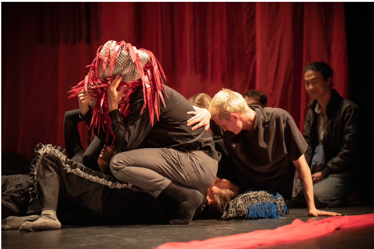
IMAGE: FROM PROCESS SHARING OF ROCK-A-BYE.

What was evident was that we needed to have some of the rock prototypes ready as soon as the rehearsal process started, and that the movement material would be developed through working with the actual rocks. The scenography was therefore also created in very close dialogue with the designer, in order to let the movement work feed the design process, and vice versa.