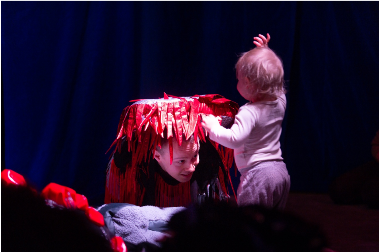
IMAGE: FROM PERFORMING ROCK-A-BYE AT KLODEN TEATER. PICTURE BY YANIV COHEN, MARCH 2023.