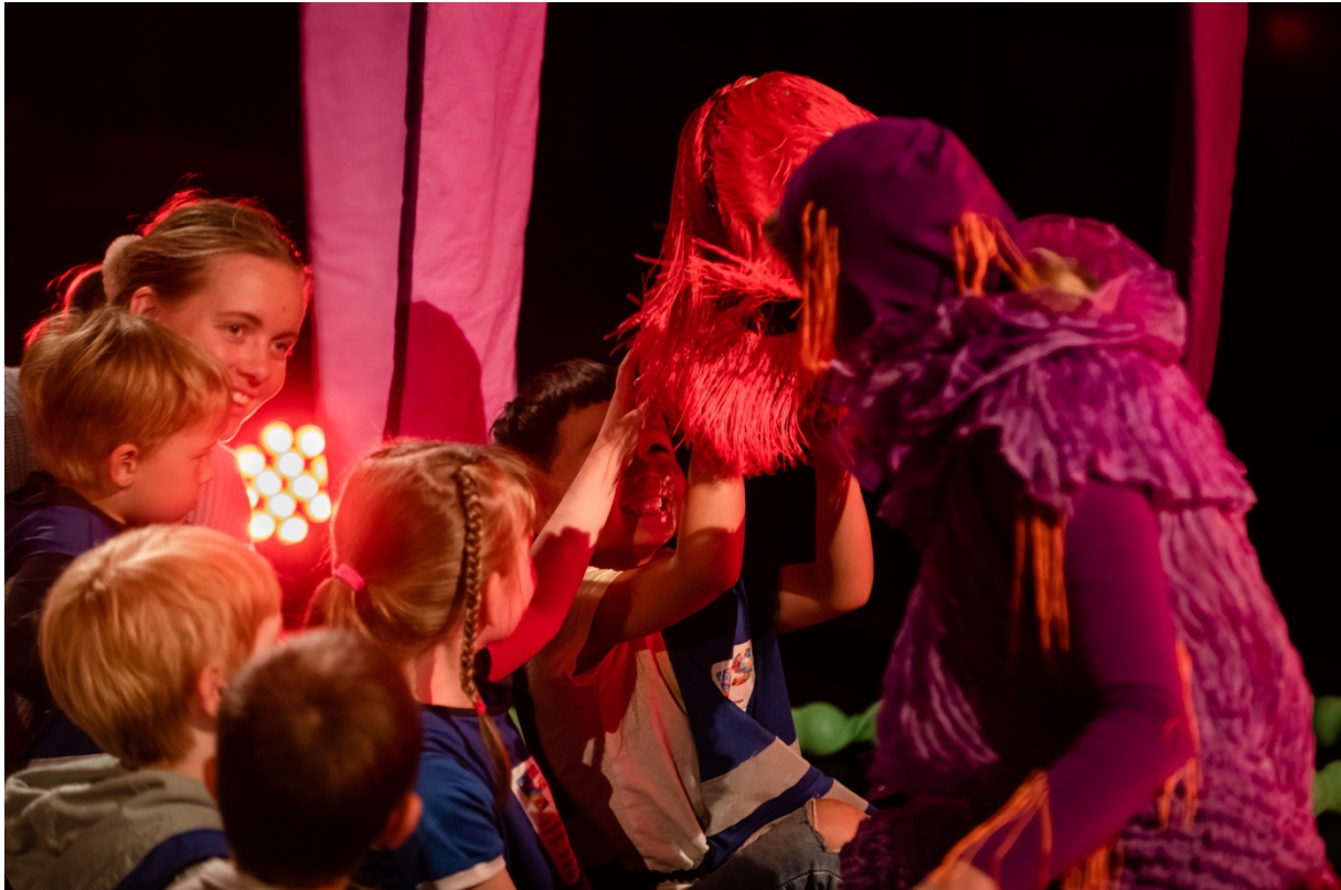
IMAGE: FROM SHOWING OF THE MA PROCESS PERFORMANCE "HIMSTREGIMSER OG ANDRE DIPPEDUTTER".