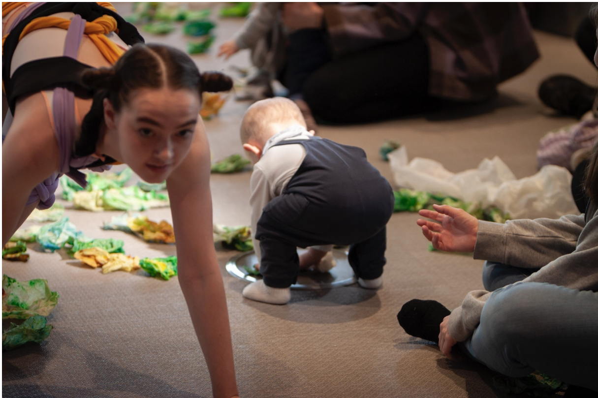
IMAGE: FROM THE PERFORMANCE "ONCE THERE WAS A FOREST".

experienced it. The material was there for them to interact with on their own premises, and created a different layer of connection between the performers and the audience. This project also had a lot of visitors in the age 0-2 years, and to see how this specific group interacted with the material inspired me to create more work for this age group.