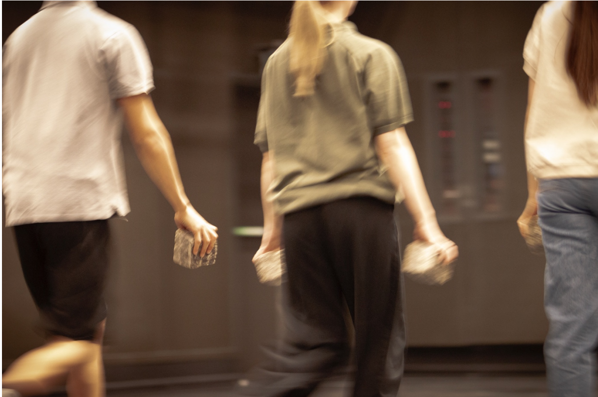
IMAGE: FROM ENSEMBLE PROJECT STONE BY STONE.

object. This exploration created both thoughts and physical discoveries that I took with me into the process and that inspired the choice of stone as material for my MA project.