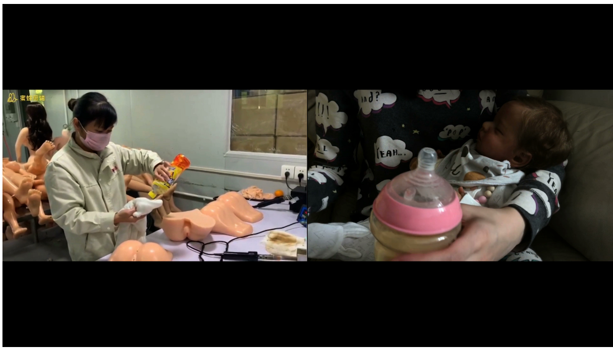
Video stills, The Second Shift (2023)