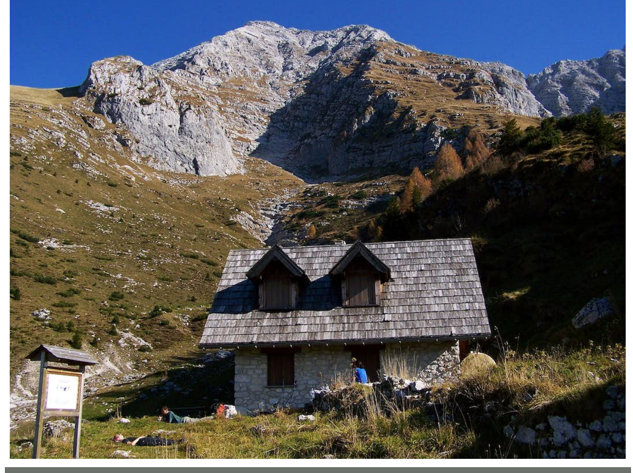
Refuges of the Casera Kanin in North Eastern Italy toward the Slovenian border: the place that, at some point, gave birth to Igory Mansotti

Occasionally we can use pseudonyms . A pseudonym is a fictitious name, not an illusory, fake or one used to hide or lie about one's identity. A pseudonym is often used when the regular identity of the author would stand in the way of the point being made, the argument or demonstration. Or, when the author needs a mask to speak the truth. So, a pseudonym is not private. It is personal . It is not secret. It is a code-name. It allows the author to make a leap, to join—or, establish—a different causal chain (Kripke) than the one within the access (reach and perimeter) of the given name.