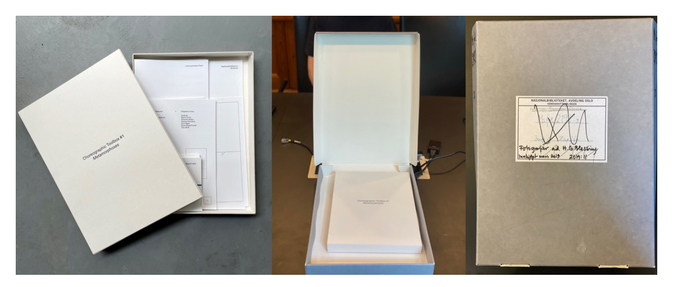
Accession of Choreographic Toolbox #01 (Janne-Camilla Lyster, 2023) at National Library Jun 23rd 2023 at 13:00-14:00 hours. The box is equipped with a variety of tools to develop a choreographic notion of metamorphosis featuring in a deck of cards. The cards result from the maker's invitation to 3 people—a body of drawings and keywords, w/an opening en closing statement on the top and bottom of the deck. By selecting from the deck and use the adjoined differently formatted & -gridded paper-standard we will acquire a notion of 'choreography'. At the accession meeting it entered the collection of the National Library as a two-sided A4 form was explained, filled and signed. It was done by Arthur Tennøe (NLN) and it took about 1 hour. At the meeting the content—now a document—was placed in a box, with all its contents. A box in the box. From this point onwards it can only be touched wearing dust-gloves. The archival box to the top right, is transition box. In the process after the accession meeting, the toolbox will have its own archival box made. We asked if it was possible to acquire a copy of the new box. This was granted.

In this shirt-sleeve account of the accession meeting, where Janne-Camilla Lyster's Toolbox # 01 was handed over, the slow choreography of the event appeared appeared with the aesthetics of a performance , to the two visitors. However, the librarian/archivist was quite clear that what we witnessed as a performative (Austin) not a performance. That is, a specialised public ceremony, like e.g. a marriage: the point being that there is no marriage unless the ritual is performed by someone entitled to do so. The attendance is not having an experience, they are witnesses .