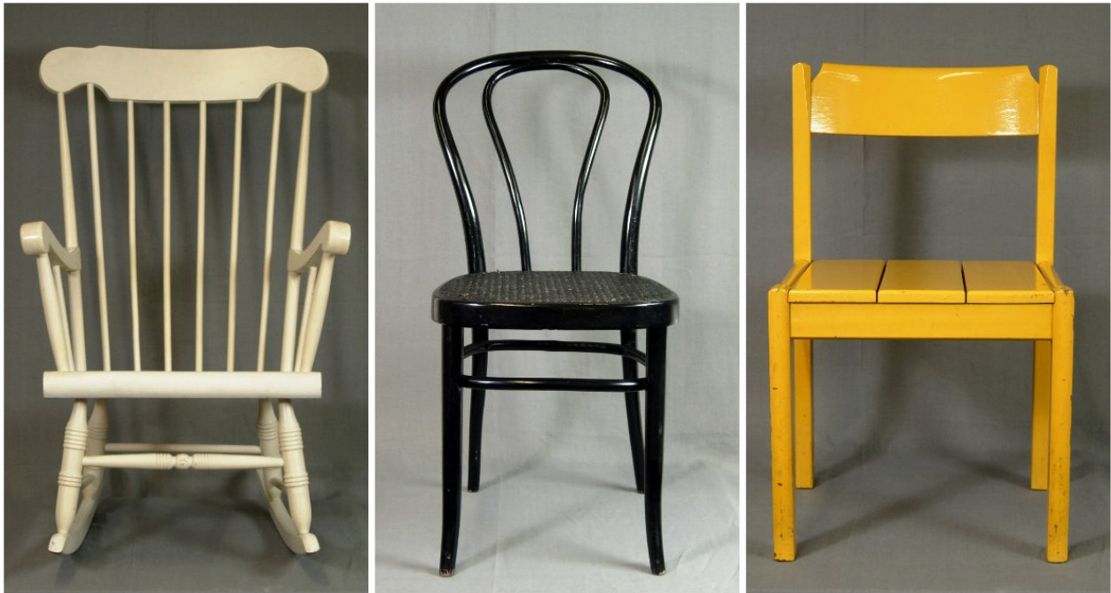
George Brecht (1961)— three chair event.