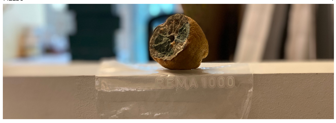
Moulded lemon—idea and concept: Jav. NB! Warning: this is a meme... featuring a moulded lemon, a REMA bag and MA location

Constituting the field is important in order to make research, practice and theory appear as such. The prime vehicle, instrument and media of the field is our record/replay of the logbook: featuring the BlackBook 1, BlackBook 2 and BlackBook 3 on the theory curriculum of the design MA. The field is neither constructed nor passively discovered: it emerges through the experiments, narratives, formats and scenarios that extend in recording/replaying the logbook. Communicative chains in which the logbook-keeper becomes involved both causally and reflectively: the field re/acts.