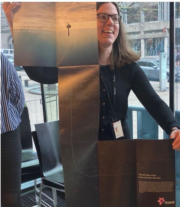
Illustrative foldout by Statoil, in the National Library of Norway's collections of small prints.

An evocation of the contemporary ethos might be that we are somehow amazed : we experience reality as a maze and we are caught in it. Our chances of finding our way are likely linked to our pursuits : following hypes likely brings us deeper into the maze, while following hints will orient us differently. Following the hypes we will (pace Bruno Latour) end up vouching for a mass-exodus to Mars, for those who can afford (e.g. Elon Musk). Or, we could build a home in the maze .