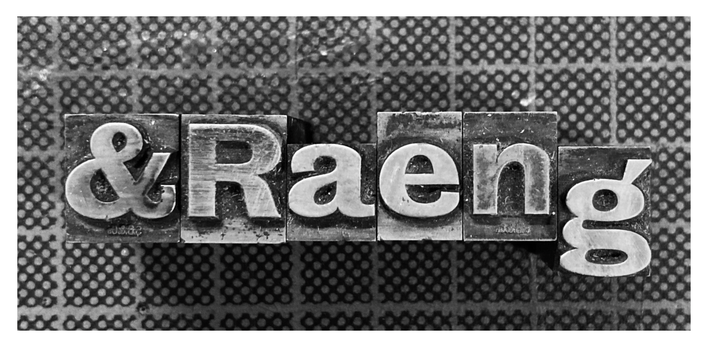
A grotesk typeface from the KHiO Publishing Workshop, labeled "Bred Engelsk Steinskrift".

The dominant letterform of the 20th and 21st century is the sans serif – from the French, meaning "without serifs". Its unadorned monolinear appearance captures at once future-facing optimism and the skeletal essence of ancient writing. Attributed to the sans serif, and in particular to its most influential sub genre: the post-war Neo Grotesks, are qualities such as timelessness, neutrality, universality and rationality.