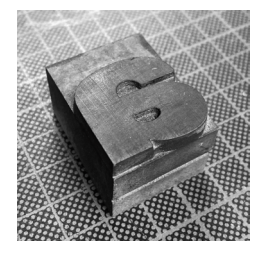
Lowercase /a/ from Paul Renner's Plak from the KHiO Publishing Workshop.