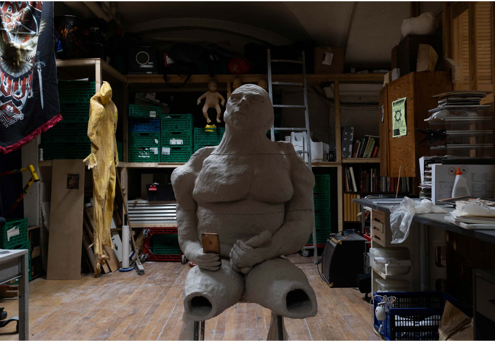
Process pictures from my studio.