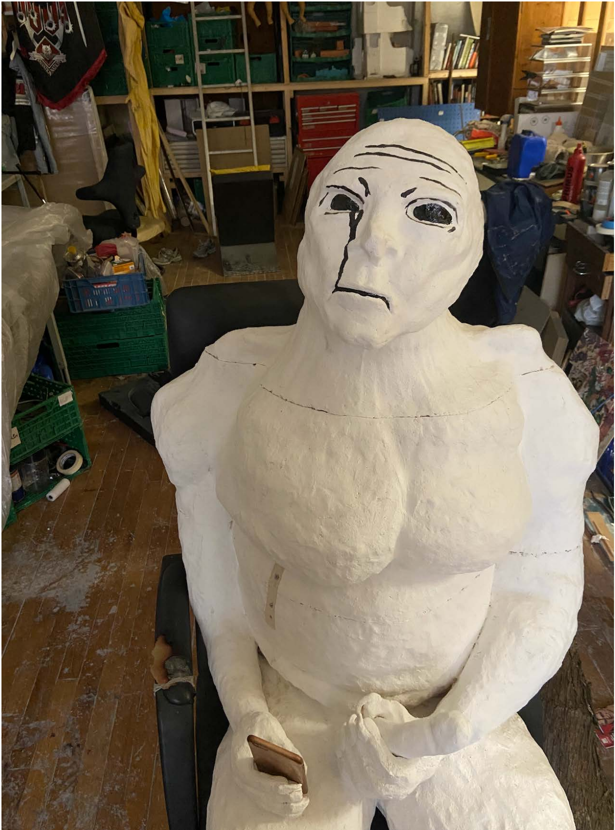
Process pictures from my studio.