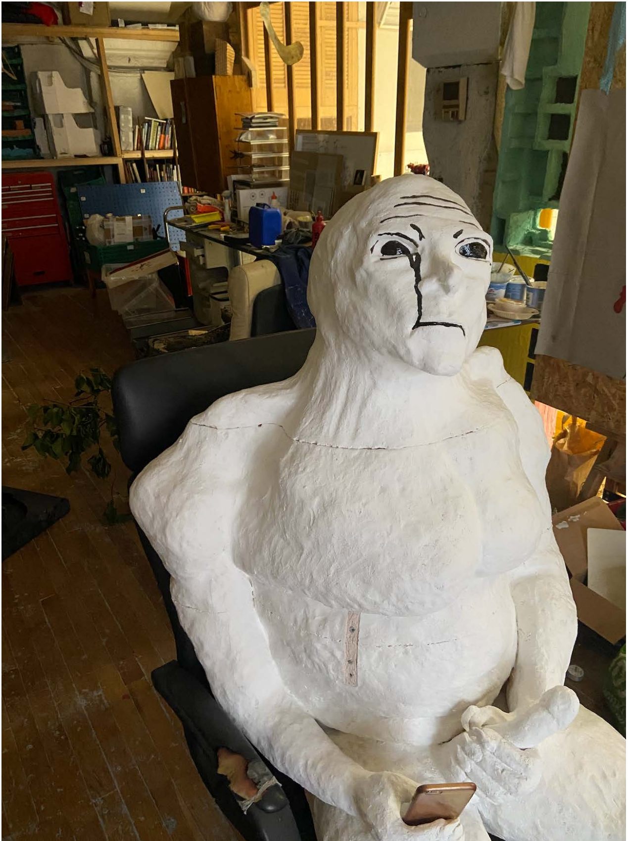
Process pictures from my studio.