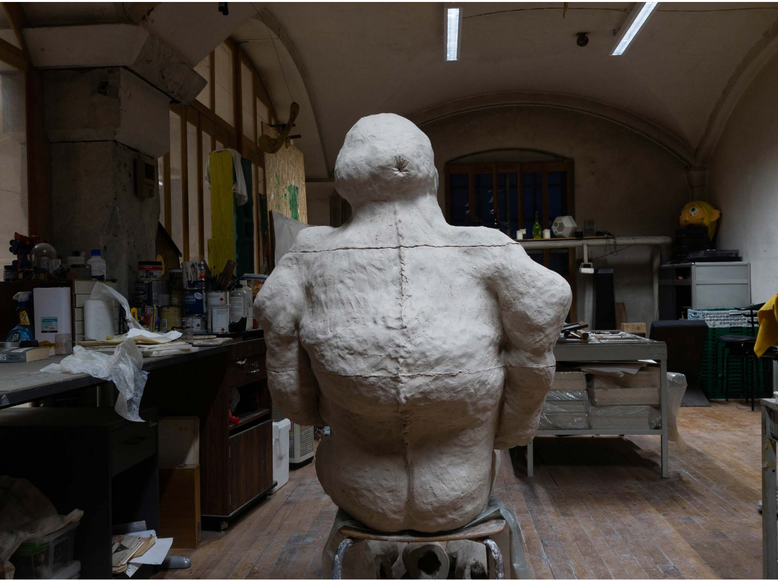
Process pictures from my studio.