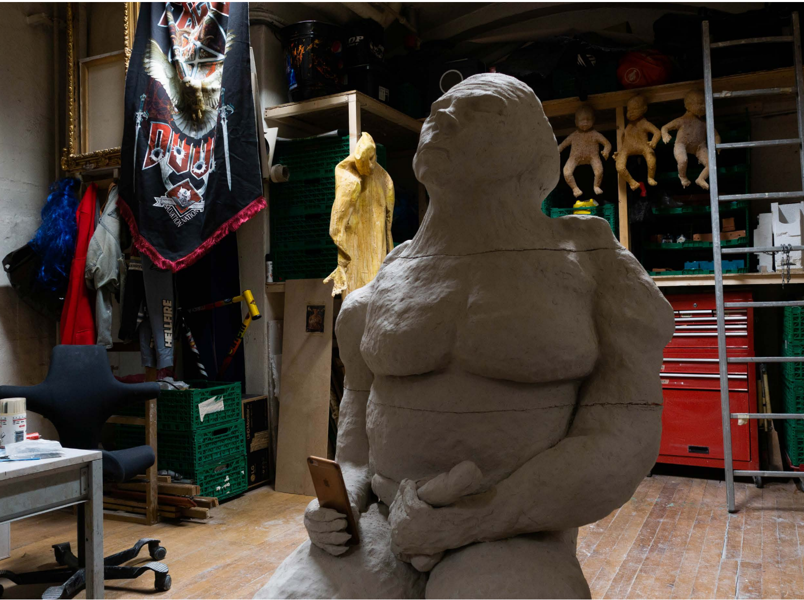
Process pictures from my studio.