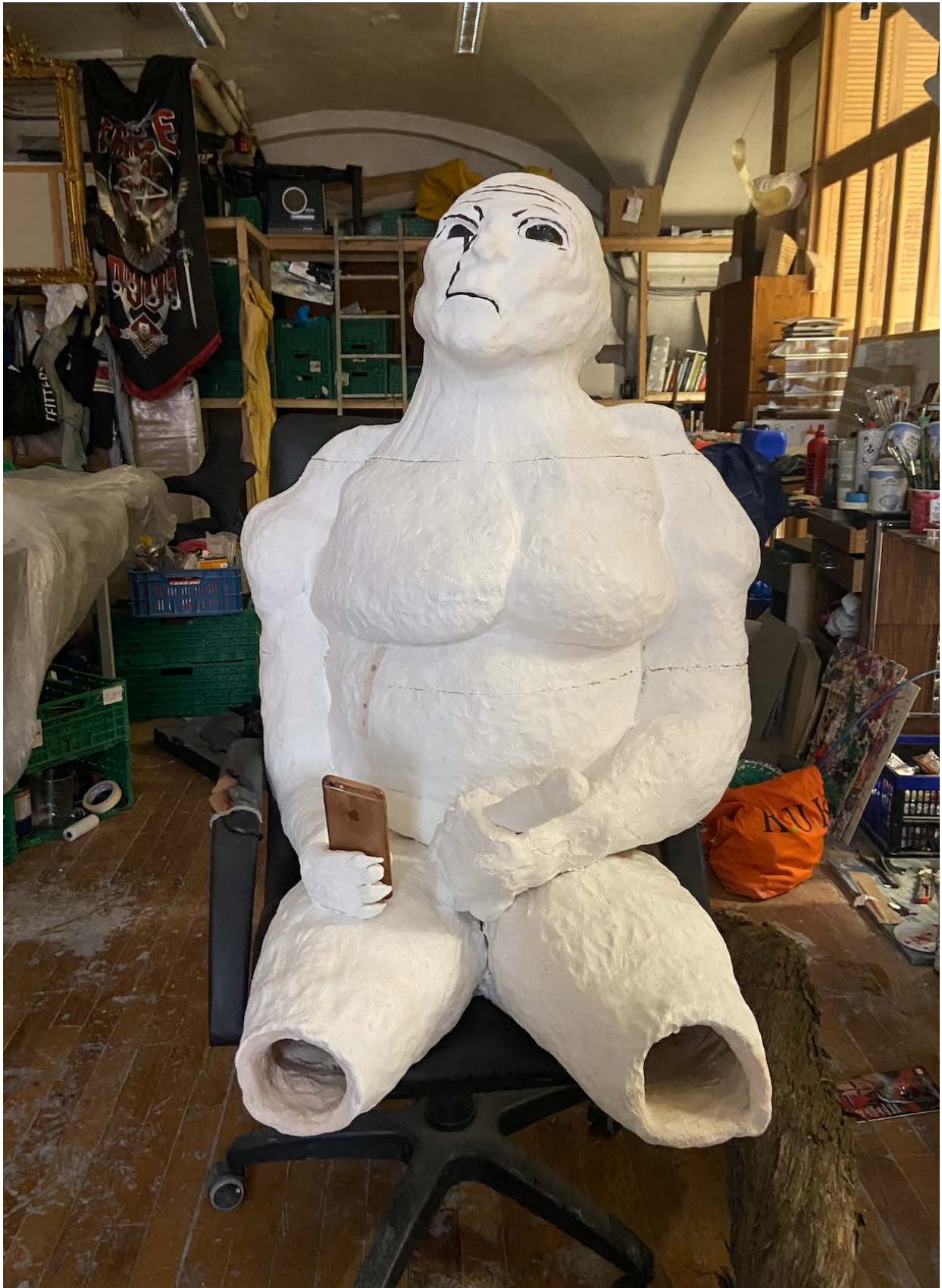
Process pictures from my studio.