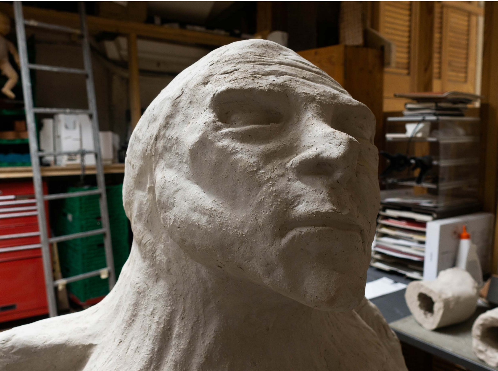
Process pictures from my studio.