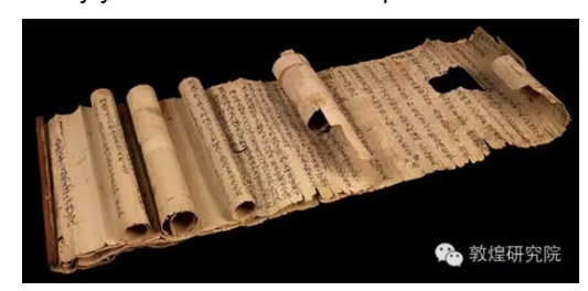
- traditional Chinese scroll

The first one, based on the traditional Chinese scroll, the most common form of scroll Chinese painting. I chose this as the main display method because It is like the oldest movie. You can look to the right and left by yourself and then will expand the whole story.