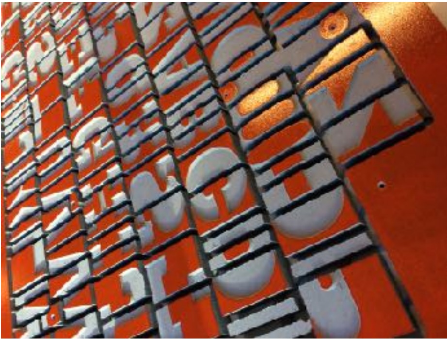
Printing of the Matrix as a poster.