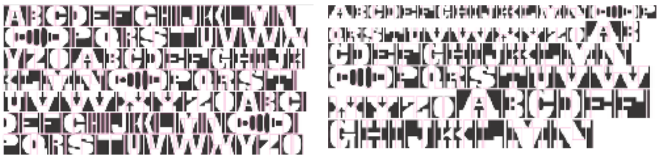
ANTI TYPE - Letter Design using Glyphs & Illustrator

A number of Anti Type letter forms were designed. Lettering that is visually defined by the space in between letters. Through a combination of digital and analogue production methods resulted in three sets of printing modules. This involved a complex design process that created form that included the inverted process in the drawing, routing and cutting of these negative shapes reveals an often overlooked aspect of the reading activity.