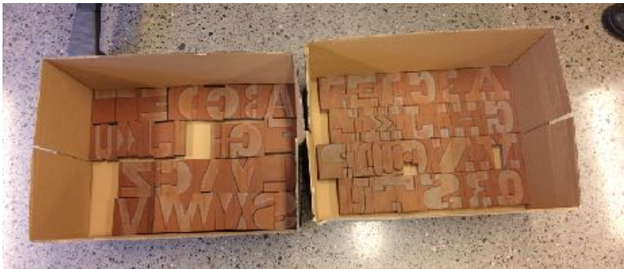
Forms developed for distribution to London and Glasgow