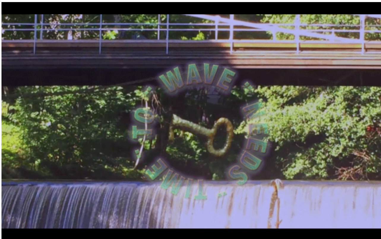
Wave needs time to wave, 2016, Akademirommet, Oslo, NO.

Wave needs time to wave, 2016 ( https://vimeo.com/188926107 ) is a title of the one of the performances which was organised in the Akademirommet in Kunstneres Hus in Oslo. I manage to invite around twenty people to act and perform - the rest was fulfilled by the public which as well was an active part of happening, contributing for example in the chorus singing, directed by one of the performers. I set up a huge plastic pyramid tent in which the event had a place. We have experienced the materialisation of the magician who was engaged in his chaotic rituals. We could meet there a holy spirit - the great mother as well, calm and grounded person meditating between another people. We spent there around seven hours, step by step watching actors performing, playing music and later on just talking - the quality of muting wheels of the wave.