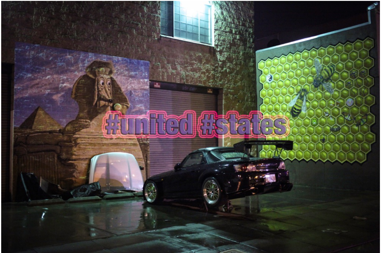
#united #states, 2016, The Lab, San Francisco, US